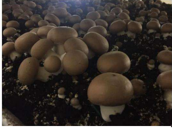
Teagasc Advisory - Mushroom E-Bulletin 1, Jan 2021