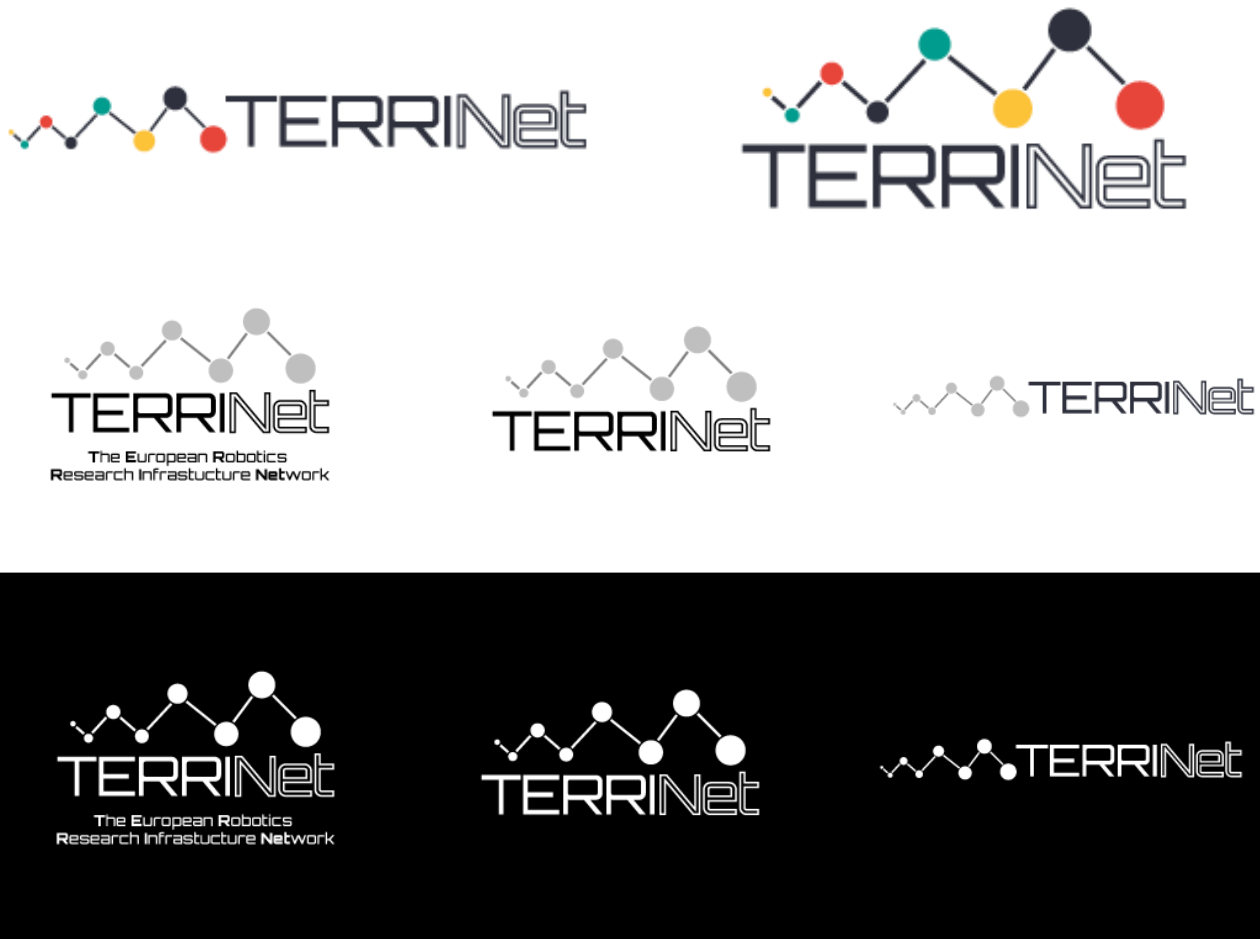
Figure 3 - TERRINet logo variations

It has different versions in shape (horizontal and vertical) and colors (four-colour, greyscale and negative).