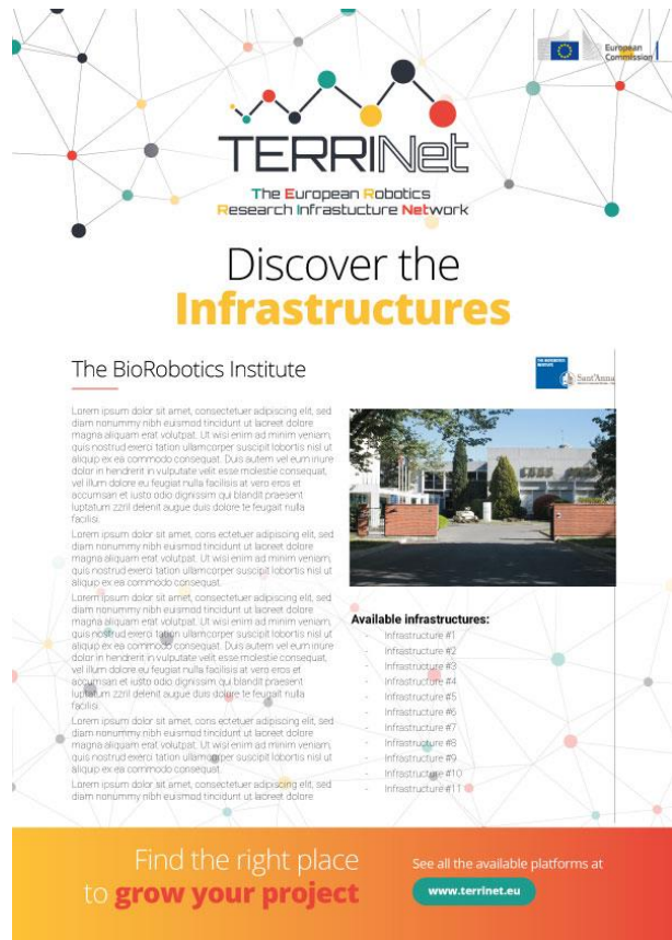
Figure 4 - Infrastructure flyer (fac-simile)