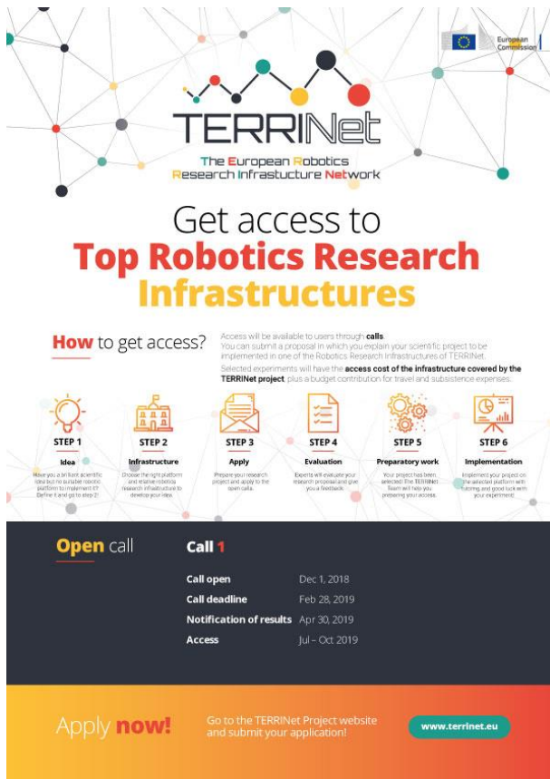
Figure 5 - Access flyer (fac-simile)